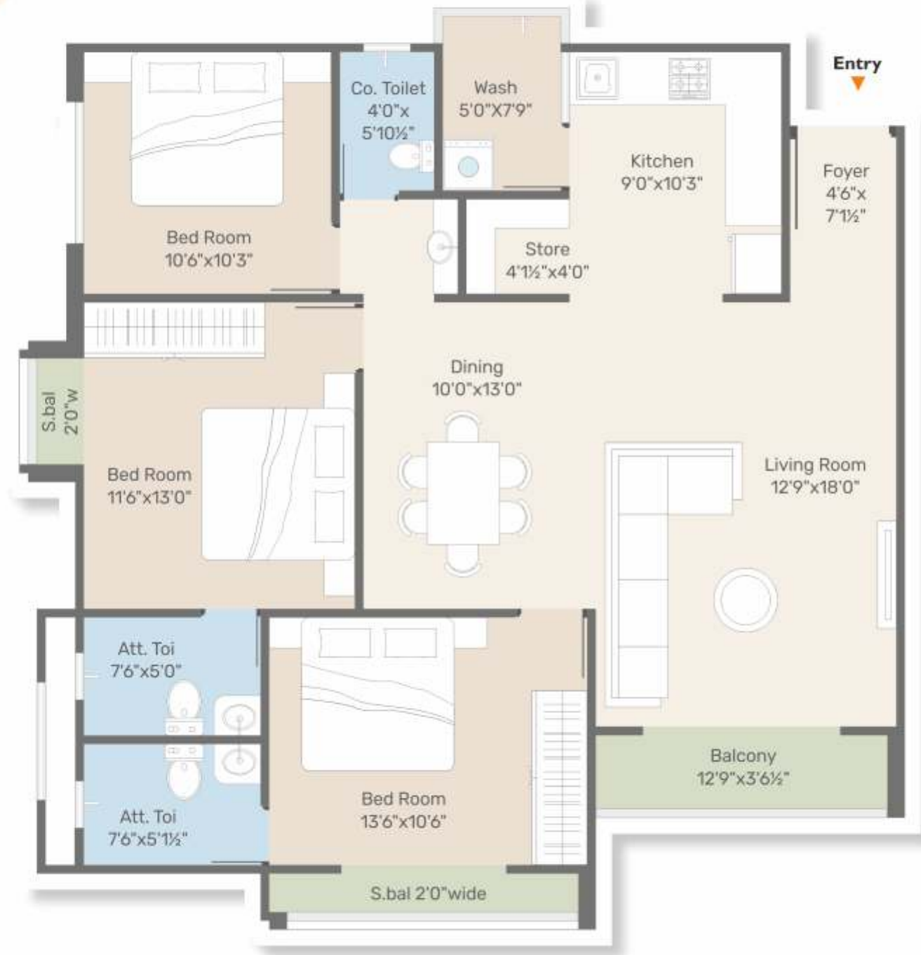
1st, 2nd, 4th & 5th Floor